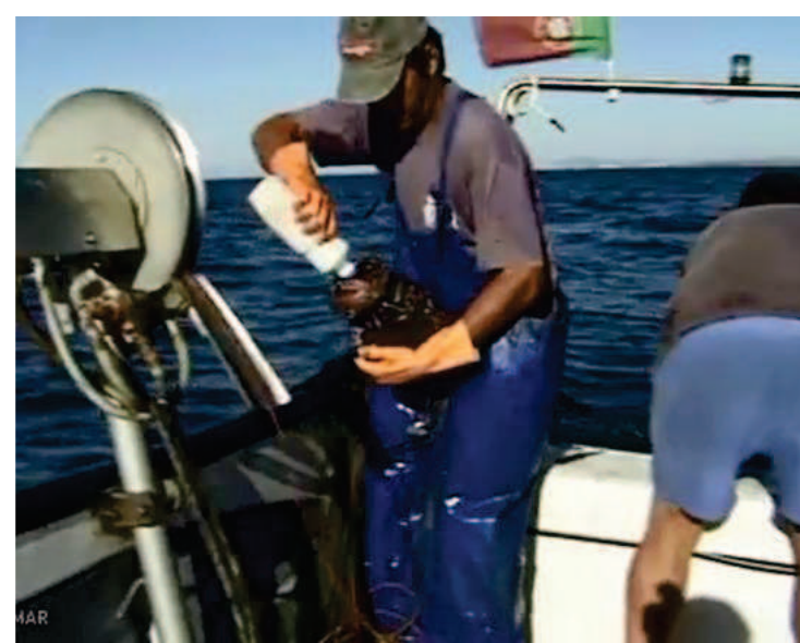
Extruding by bleach