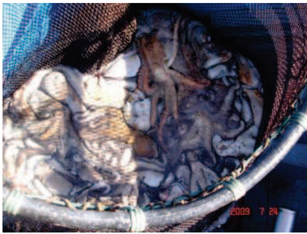
Holding in suspended net